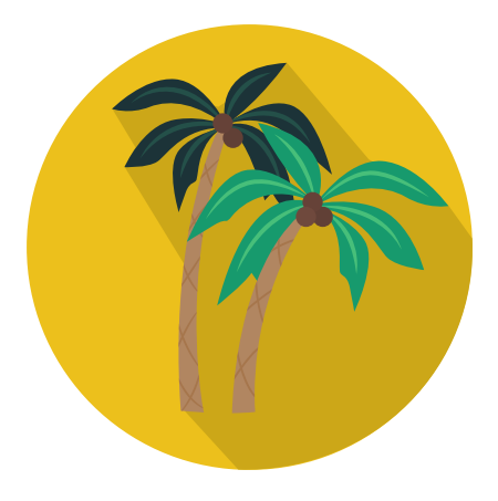
A worldwide adventure?