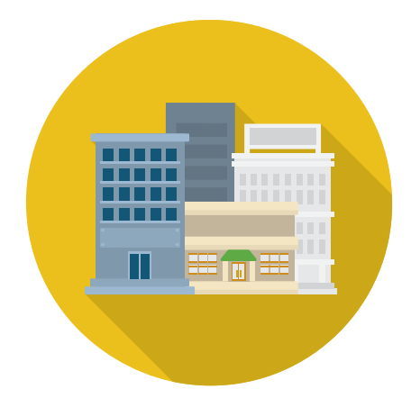
Moving to a new city?