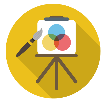
Pursuing a passion?