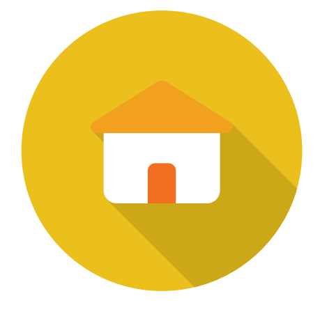
The simple life?